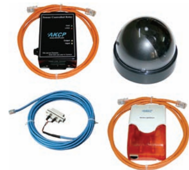
AKCP Intelligent Sensors