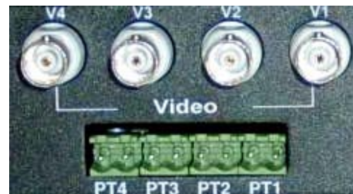
The RCA receptacle inside the securityProbe

Live full-color streaming video is available at up to 30 fps (320 x 240 resolution) via the web interface, and up to 50 streams of video can be accessed simultaneously. Standard JPG format pictures are used, allowing the use of third party host tools to store and analyze the JPG pictures. All pictures are in the Standard JPG format and the Standard CIF picture size is 352 x 288 pixels or VGA (640 x 480). The pictures can be easily downloaded from the securityProbe into a local host.