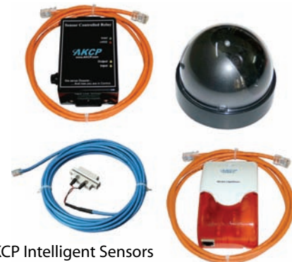
AKCP Intelligent Sensors