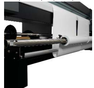
Dual Roll printing