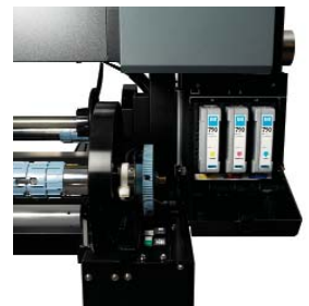
1000 ml HP Ink Supplies