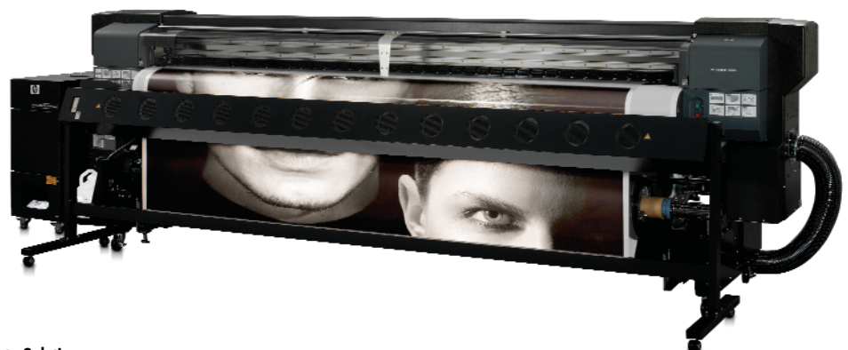
HP Designjet 10000s Complete Solution