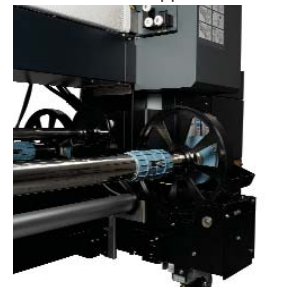
HP Super heavy duty take-up reel